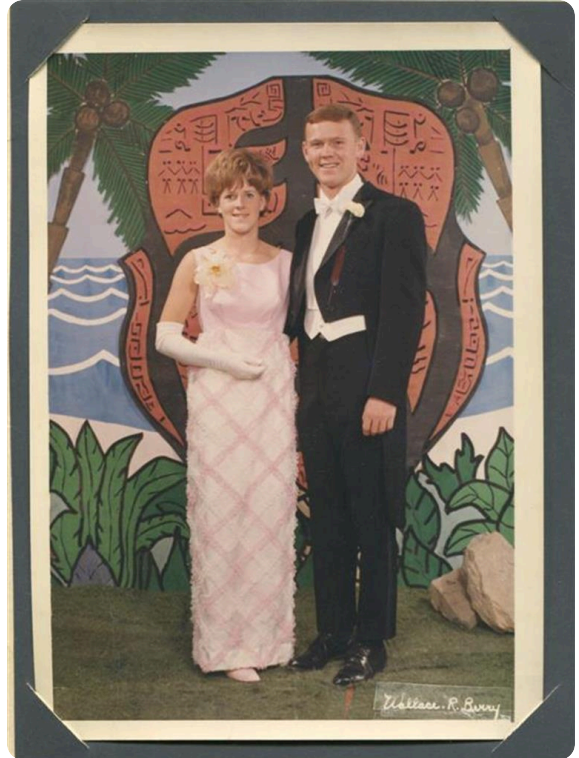
Queens engineering formal